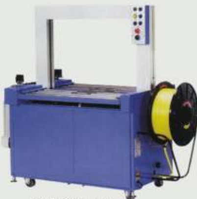
PW-0860AS2R (Top Roller Driven)

We Supplies Fully Automatic Strapping, Taping, Palletising line as per Customers Requirement