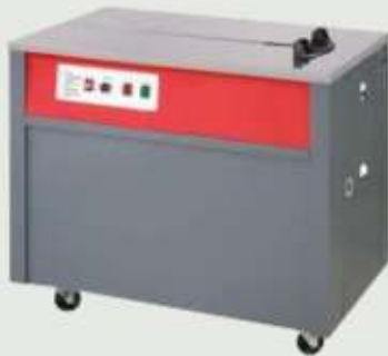
PW-316H (Heavy Duty)

ONE TOUCH & EASY OPERATION : Turn the power on and you are ready to strap your packages. Motor stops automatically when not in use within preset 60 seconds to save energy and prolong motor life.