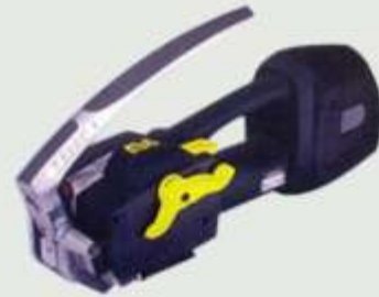
Battery Powered Strapping Tools