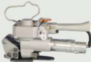
Pneumatic Strapping Tools